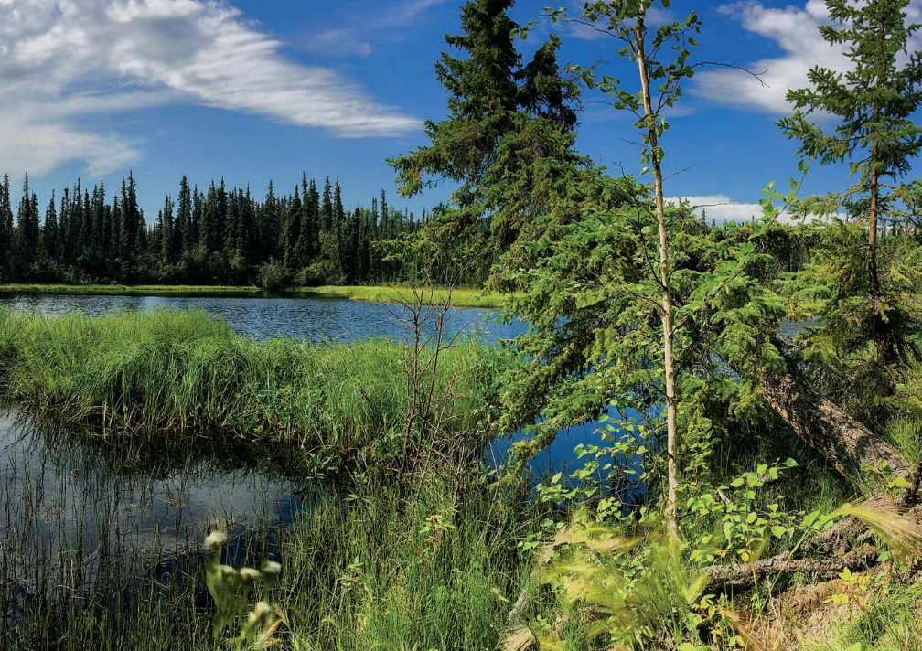
A “drunken tree” tips over a lake near Fairbanks, Alaska, a sign of loose soil and thawing permafrost.

permafrost. The program, called the Arctic-Boreal Vulnerability Experiment (ABOVE), began in 2015, but this summer marks the first time its nine aircraft have fanned out across Alaska and Canada’s Yukon and Northwest Territories in an effort to link precision measurements of permafrost at field sites to remote sensing data.